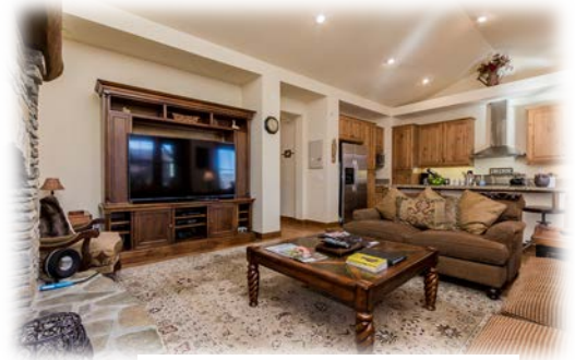
1108 Pyramid Peak- The Lodges

Year-to-date 2018, the condominium market is on par with the 27% increases observed in 2017. As of June 1 st , 2018, Median prices for a condominium in Mammoth Lakes were $390,000. This is based on a total of 141 sales. This median sales price is 11.46% above the median price observed for all of 2017.